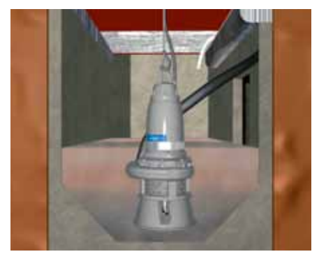
Internal cooling for pumping down to low levels.