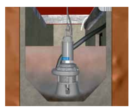
Agitator for coarser slurries.

Standardized for portable, wet installation, 5100/5150 slurry pumps are versatile and easy to install. Each pump is supplied with a built-in support stand and is free-standing, requiring no additional support structure. The Victaulic<sup>®</sup> flange and coupling allows fast, easy connection to a wide range of commonly available fittings.