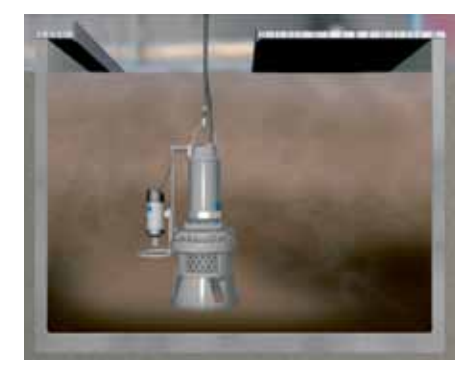
Side-mounted mixer for the really tough jobs.